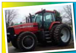
CASE IH - MX240, '00, 2300 hrs., rear duals, front wheel assist, front and rear weights, 3 valves, $77,500 Very good condition.

NEW & USED HYD. EJECT & DUMP TYPE SCRAPERS, TOREQ by Steiger Mfg., Prime Soilmoover, Leon, Misken, 3 to 18 yd. USED: 12 yd. Cable Converted Hyd. Eject., Several Shingle Axle and Tandem Daycabs. Grand River Sales 660-548-3804 www.grandriversales.com